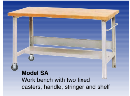
Model SA Work bench with two fixed casters, handle, stringer and shelf