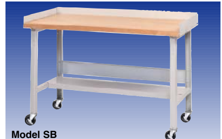
Model SB Work bench on four swivel casters with foot brakes, stringer, shelf and back & end stops.