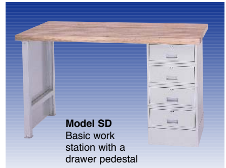
Model SD Basic work station with a drawer pedestal