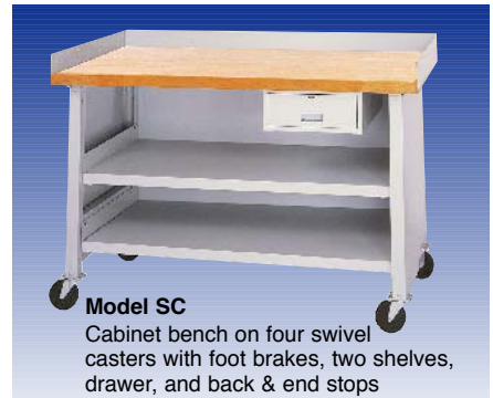
Model SC Cabinet bench on four swivel casters with foot brakes, two shelves, drawer, and back & end stops